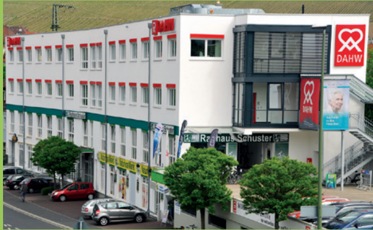
DAHW headquarter in Würzburg, Germany